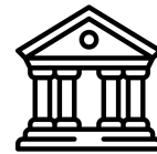
Garda City Hall